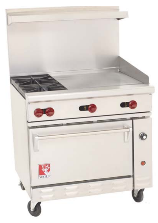
Model C36S-2FT24 shown with optional casters